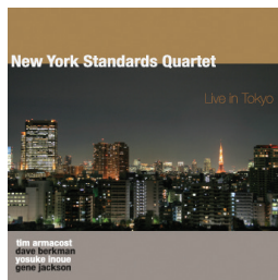
Live In Tokyo 2008